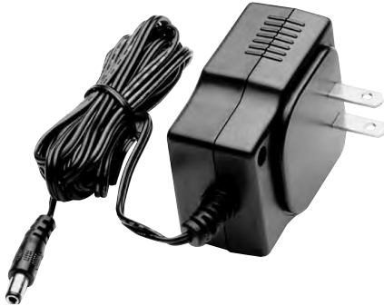
2.56" x 2.17" x 1.40"